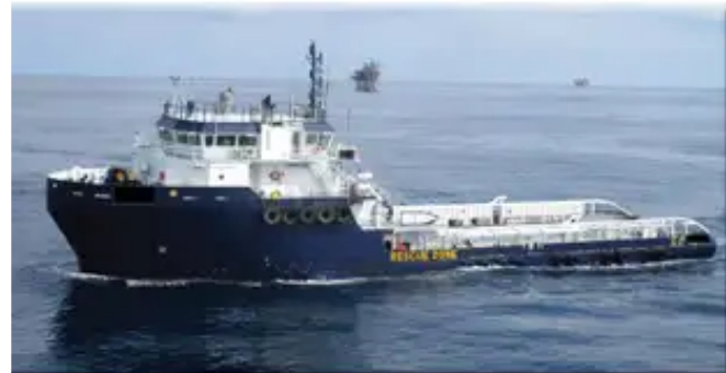
5,900 BHP ANCHOR HANDLING TUG/SUPPLY VESSEL